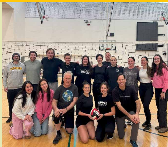
Above: Players in the 2025 tournament.

The annual Orillia Faculty of Education intercohort-faculty volleyball tournament was held in March at the Orillia Recreation Centre. This year Cohort B2 emerged as the overall champions! Congratulations!