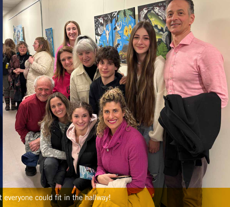
The Art Walk at Bora Laskin building drew such a large crowd that not everyone could fit in the hallway!